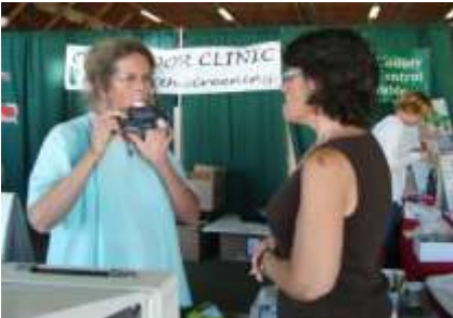
ODC at Addison County Fair and Field Days holding health screenings for attendees